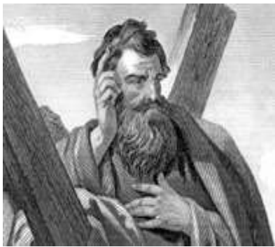
SAINT ANDREW, APOSTLE PATRON OF SCOTLAND

Andrew lived in the first century: a fisherman by trade, together with his brother Simon. He was called by Christ to one of the twelve. According to Tradition he preached the Gospel in Greece, where he was martyred. St Andrew is the patron of Greece and Scotland, amongst other places.