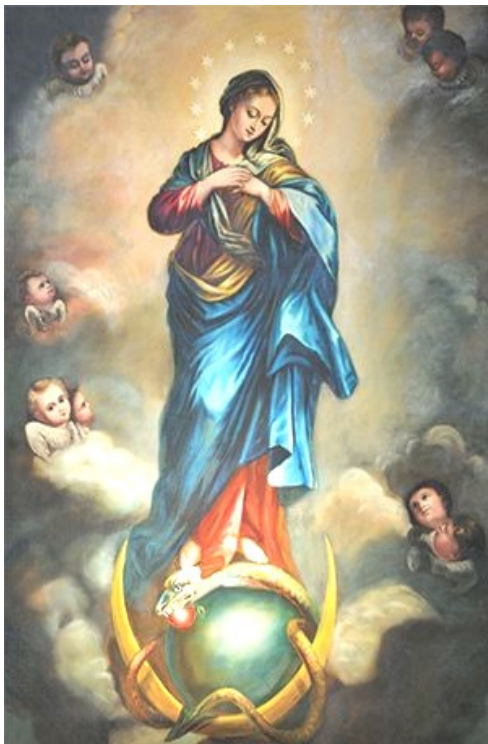
Thou art she who crushed the serpent

Toiletries especially shampoo, deodorant, disposable razors, mouth wash, hand sanitiser, baby wipes, non-perfumed hand cream. All donations can be left in the sacristy in either church. Last date will be Sunday 17th December please.