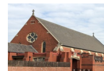
Ss. Mary & Benedict