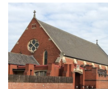
Ss. Mary & Benedict