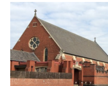
Ss. Mary & Benedict