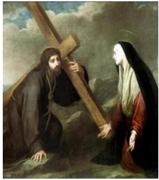
IV Jesus meets his mother

The feast of Our Lady of Sorrows follows naturally the Feast of the Exaltation of the Cross. This meeting of Jesus and Mary on the Way of the Cross is one of the saddest moments of the Passion, a moment of profound pain for both the Lord and His Mother; We can imagine recalling the words of the elderly Simeon: "A sword will pierce through your own soul" (Lk 2:35).