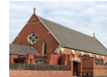
Ss. Mary & Benedict