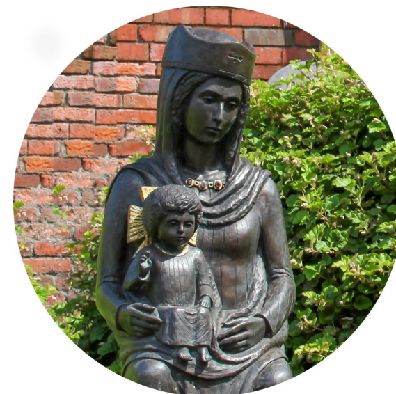
Our Lady of Coventry statue located in Priory Gardens near Coventry Cathedral

This leaflet shares information to help us plan our future. We would like you to be involved in the decisions.