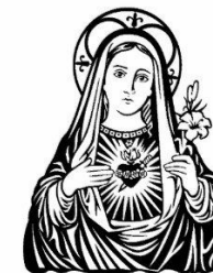
Our Lady of the Sacred Heart

Archdiocese of Birmingham Registered Charity 234216